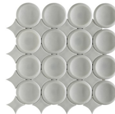
CIR-06M Light Grey