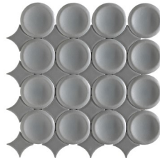
CIR-04M Dark Grey